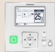
Min. Temp° control on the fan blower with the remote control PC-ARF1E or the CSNET monitoring system